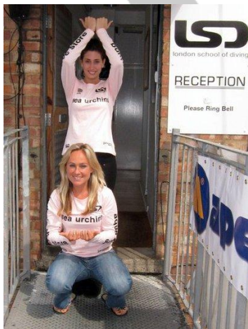
Left: Stacy Soloman

This year we had a some celebrities join the LSD crew to ample the delights of diving which included X Factor contestant Stacey Solomon, Dragons Den Theo Paphitis, genius Irish comic Dara O'Briain from BBC's Mock the Week and the England Rugby team using the pool after the Twickenham internationals. There are plans in 2012 to have all the Ladies Volleyball teams for the Olympics in to use the pool. Yeeeeeeeeee right!