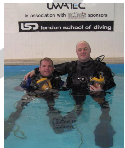
Right: Dara O'Briain

LSD had its second Open Day which was a fantastic success again offering great deals on courses and materials. Thanks to all who helped and we look forward to next year's get together.